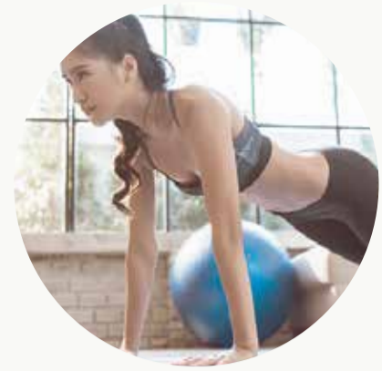
FITNESS AND EXERCISE