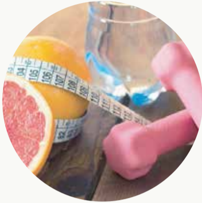
DETOX AND WEIGHT LOSS